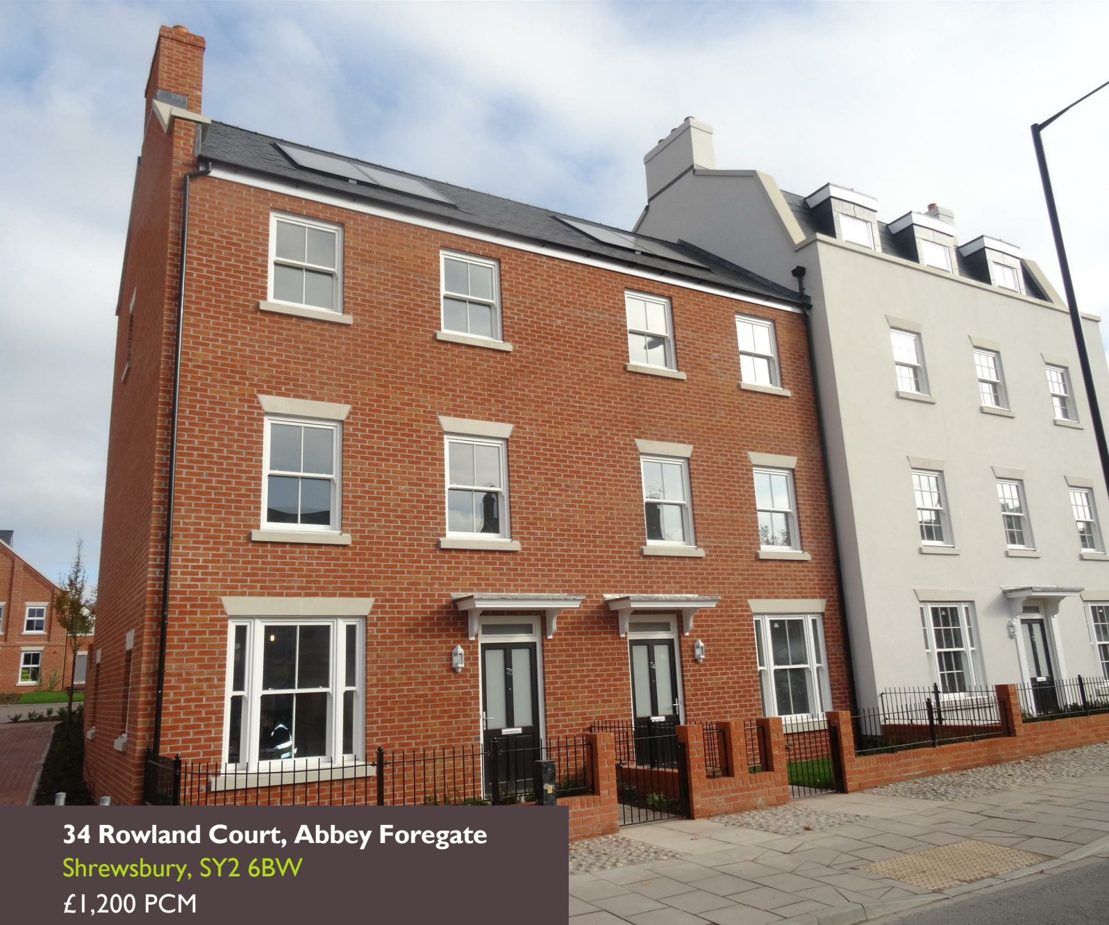
34 Rowland Court, Abbey Foregate Shrewsbury, SY2 6BW £1,200 PCM